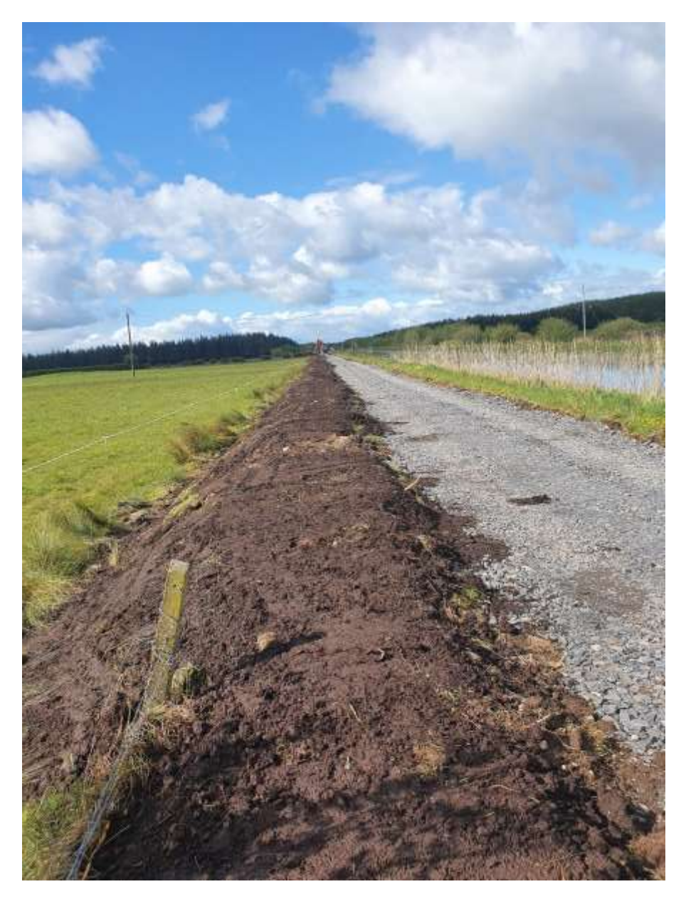
Fig2 – Taken at CH9200 looking South. Embankment, excavation terram & stone base laid.