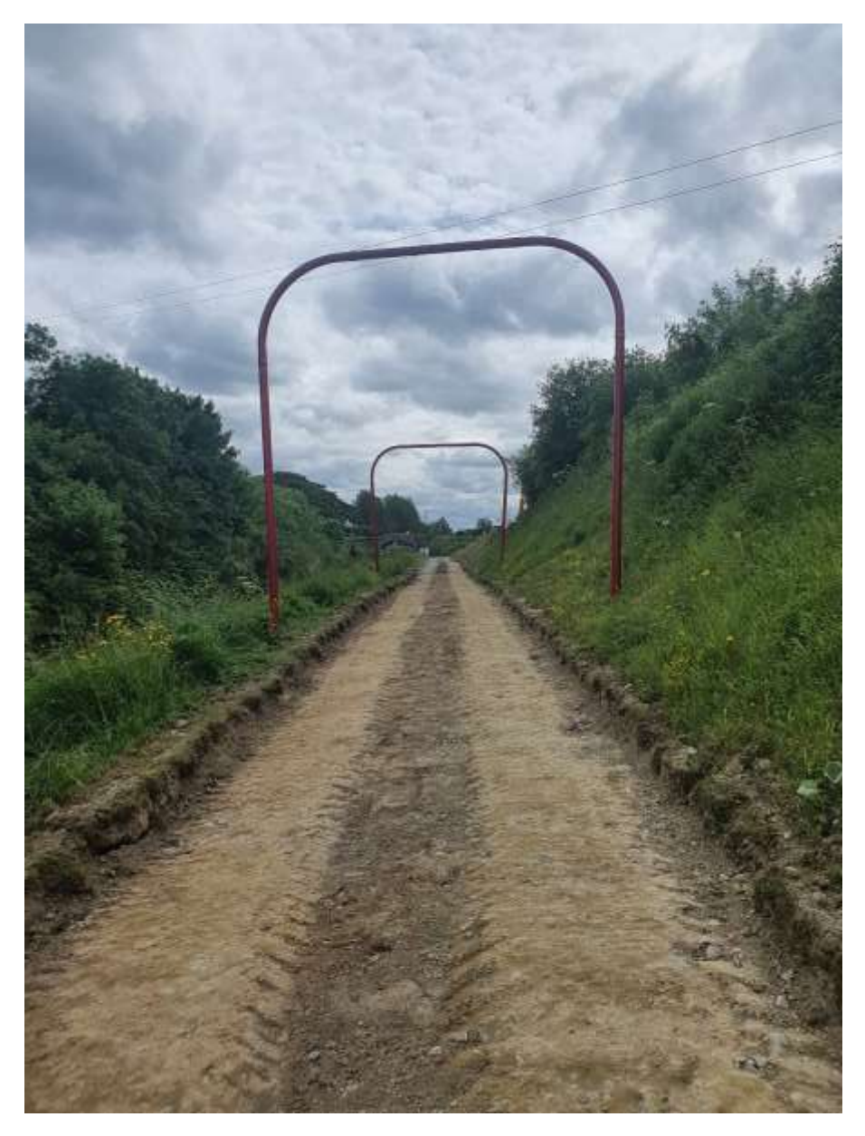
Fig6 – Looking south to Courtwood Bridge, Excavation completed.