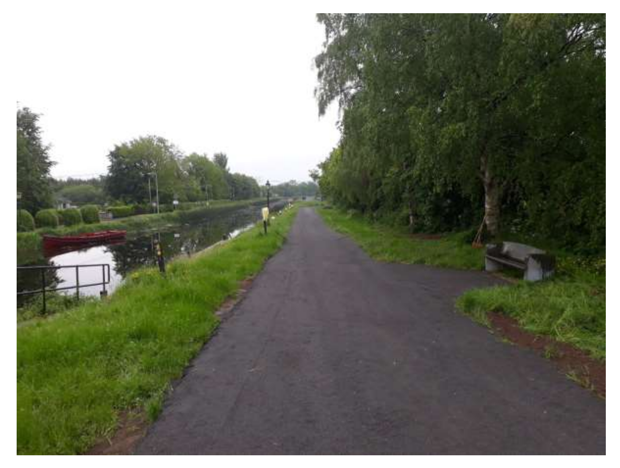
Fig5 – Vicarstown looking south, Blueway complete (June 2021)