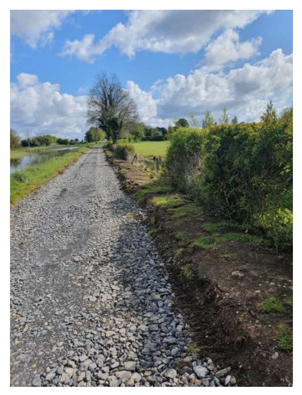
Fig 1 – CH9000 looking North to Glenaree. See embankment works to right of picture